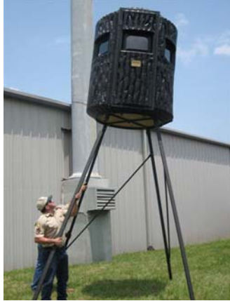
12. Tilt blind back on two legs and install fourth leg.