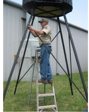
14. Install remaining braces.