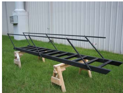
4. Install black plastic caps in open hand rail ends.