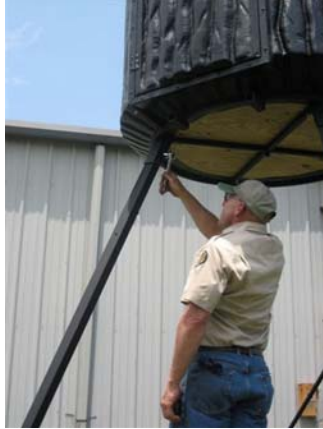
13. Secure 4th leg with 1" x 1/2" hex bolt.