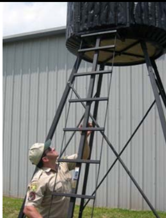
15. Slide ladder into ladder brackets.

Ladder attachment/assembly. For optional stair assembly see page 4.