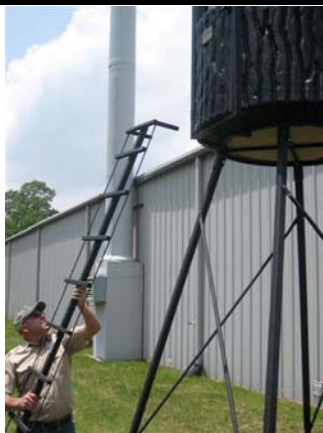
1. Remove ladder (or optional stairs).