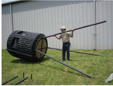
4. Install third leg in 12 o'clock position and tighten with 1" x 1/2" hex bolt.