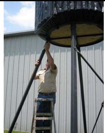
2. Remove two braces and loosen leg socket nut.