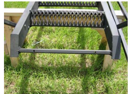
5. Lift stairway and set stairway attachment bracket over tower ring attachment brackets and bolt together using 3" x 3/8" hex bolt, 3/8" lock washer and 3/8" hex nut with 9/16" socket and wrench.