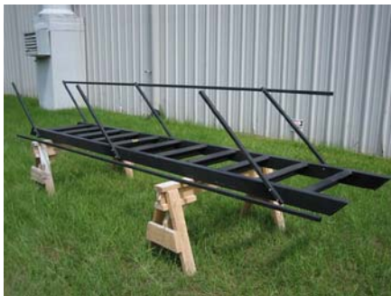
3. Attach hand rails as shown using 2 1/2" x 5/16" hex bolts, 5/16" lock washers, and 5/16" hex nuts with 1/2" socket and wrench.