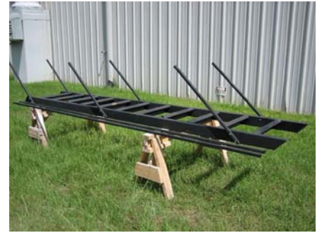
2. 5' stairway has 4 supports, 10' stairway has 6 supports, and 15' stairway has 8 supports.