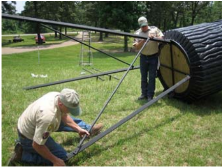
6. 15' tower will have two braces per side in an X pattern. 5' tower will have no braces.