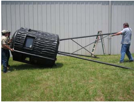
6. Remove remaining braces and legs. For ease of future assembly leave tower ring attached to blind.