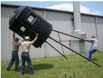
9. Make sure the feet of the two legs the blind will be pivoting on are secured so they don't slip while lifting. From this point in the lift, the blind can also be pulled up with a vehicle.