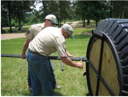
3. Tighten with 1" x 1/2" hex bolt through weld nut located in leg socket using 3/4" socket.