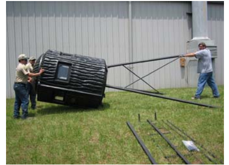
8. Use number of people you feel is required to accomplish lift safely.