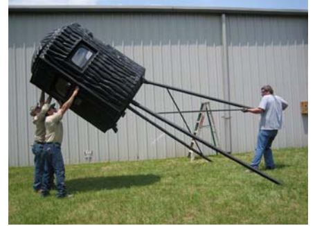
5. Ease blind down using adequate manpower or a vehicle to accomplish task safely.