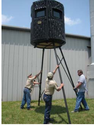
4. Secure the feet of the two legs the blind will be pivoting on.