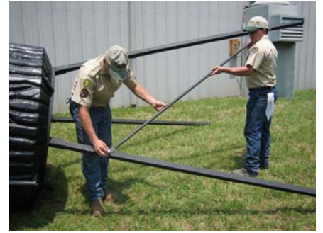
5. Install leg braces using pre drilled holes in legs as shown. Use 3" x 5/16" hex bolts, 5/16" lock washer, 5/16" nut and 1/2" wrench. 10' tower has one cross brace per side as shown.