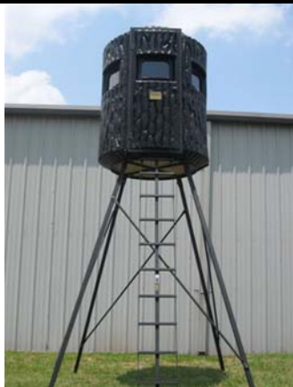
18. Tower assembly complete. To take down reverse erection procedures.