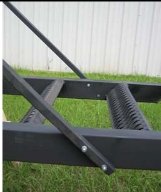
1. Bolt handrail supports to stairway as shown using 3 1/2" x 5/16" hex bolt, 5/16" lock washers and 5/16" hex nuts with 1/2" socket and wrench.