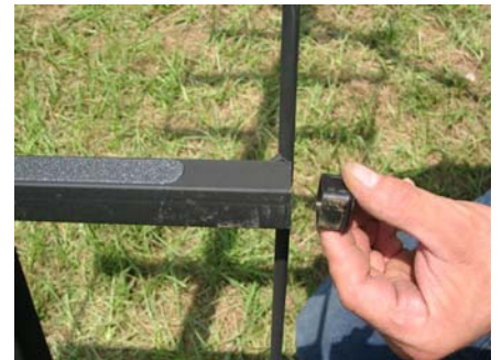
17. Install 1" plastic caps into ladder rungs. Install nonskid on rungs.