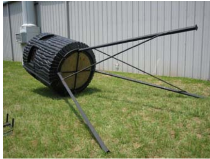
7. Blind with 10' tower ready to be stood up.