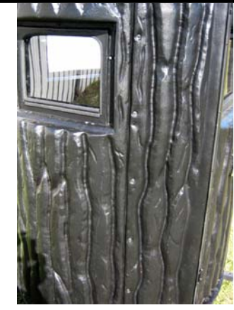
11. Next, screw remaining screw locations on all three seams.