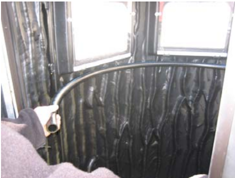
12. Install inner ring against bottom windows.