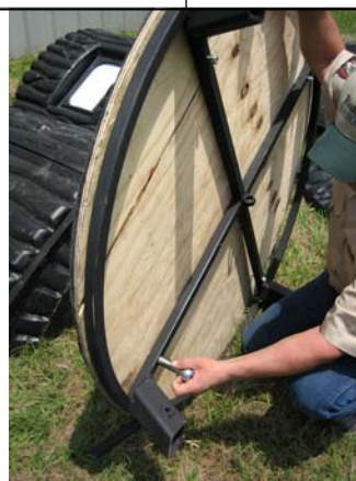
Blind pieces with tower ring

1. Loosen the four floor bolts with 9/16" socket wrench.